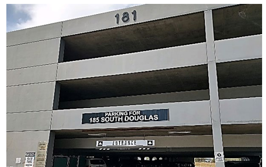
*Entrance to Student Overflow Parking at 181 S. Douglas St., El Segundo.